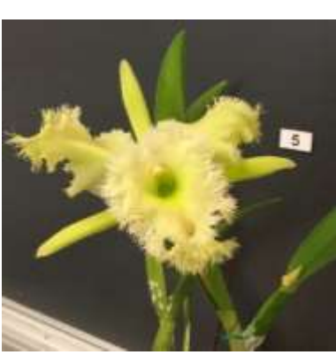
Blc Golf Green Hair Pig, Deb Boersma