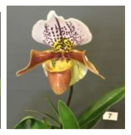
Papa Hsinying Compensa x Hampshire Zoo, Renee Gignac