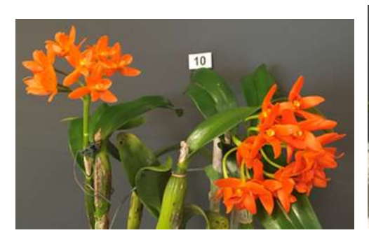
Guarianthe aurantiaca 'Gold Country'