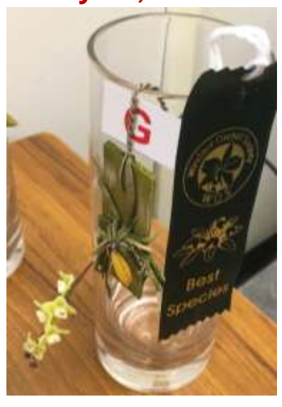
BEST SPECIES: Chiloschista viridiflava, C.N. Gibbons