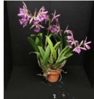
B.C. Maikai Spotted Star (D Boersma)