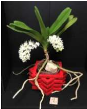
Rhyncho. Gigantea Var. Alba