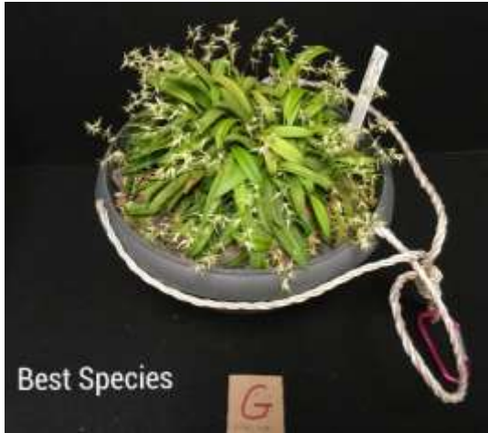
Best Species Sp. Anathallis linerifolia , C.N.Gibbons