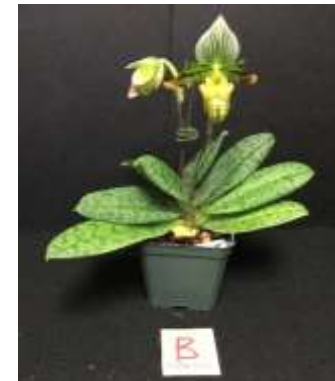
Paph. Venustum (C.N.Gibbons)

We regret that spaces limits posting pictures of all the specimens on the plant table for January. For a complete list with pictures, visit WOS's Facebook page.