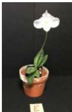
Paph. Delanatu (J Doherty)

We regret that spaces limits posting pictures of all the specimens on the plant table for January. For a complete list with pictures, visit WOS's Facebook page.