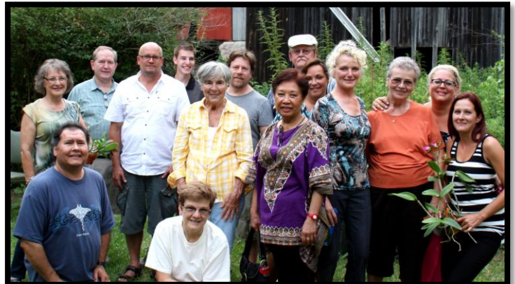
A group photo at John Marcotte Orchids