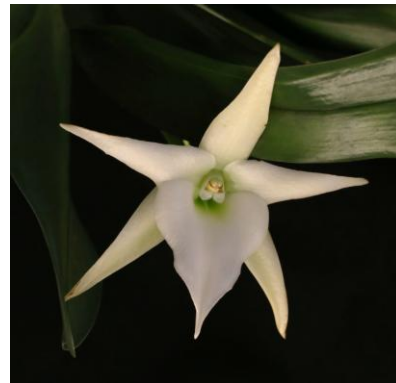
Angraecum Crestwood 'Tomorrow Star' BEST HYBRID (grown by Eleanor Sfalcin)