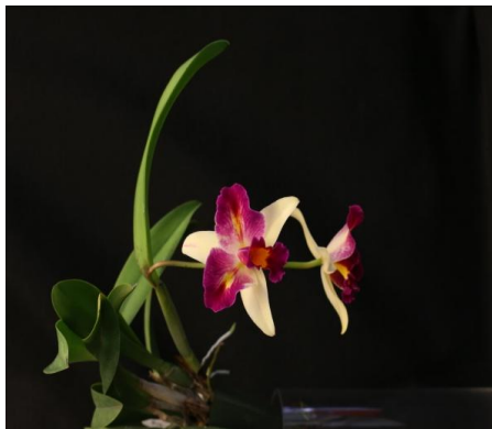
Cattleya Fire Magic (grown by C N Gibbons)