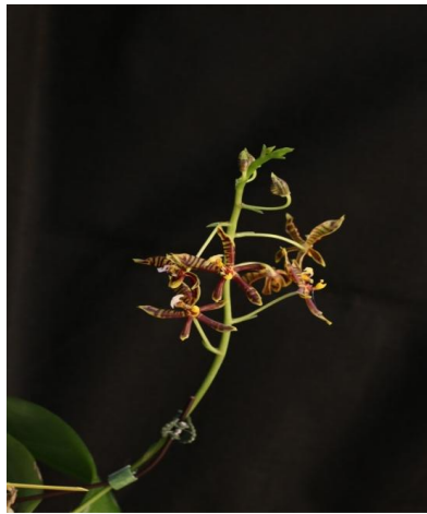
Phalaenopsis manii BEST SPECIES (grown by Deb Boersma)