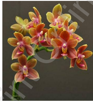
Phalaenopsis hybrid (Louise Holt)