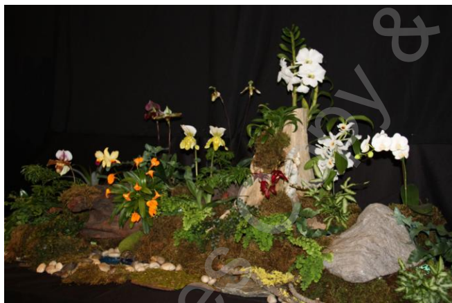
SOOS Show – February 2013

Here are a couple photos of our displays at recent Orchid Shows: