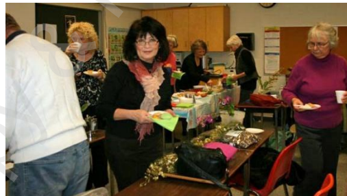
Members enjoy the refreshments