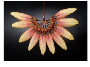
Bulb. sibuyanense