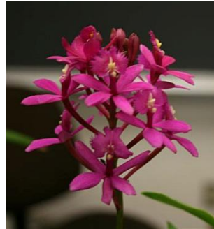
Epidendrum Hybrid (Louise Holt)