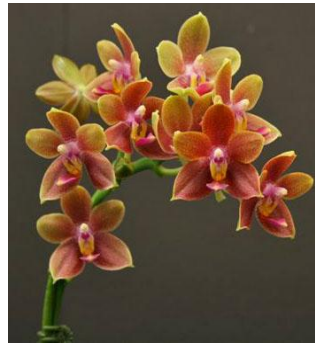
Phalaenopsis hybrid (Louise Holt)