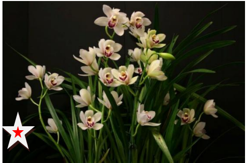
Cymbidium Hybrid (Eleanor Sfalcin)