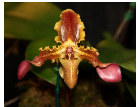
Paph. hirsutissimum var. esquirolei

This program provides an outline of the three basic categories of Paphiopedilum species, their origins and culture.