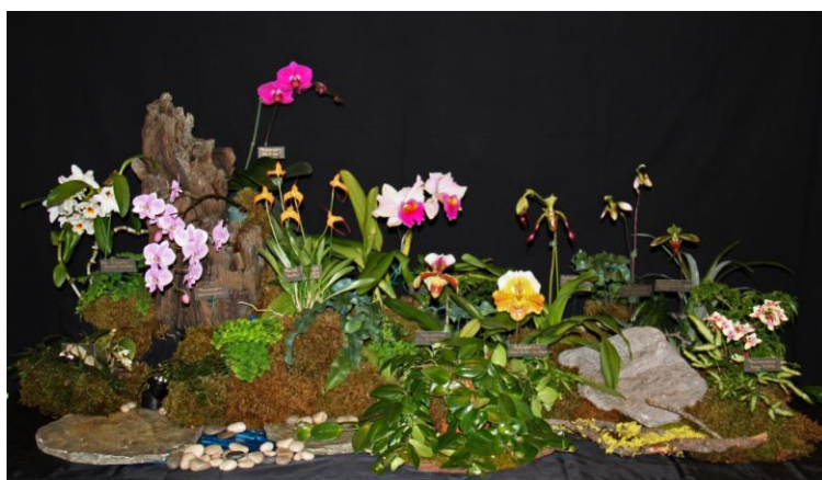
RBG Show – March 2013 (Winner of First Place Ribbon)