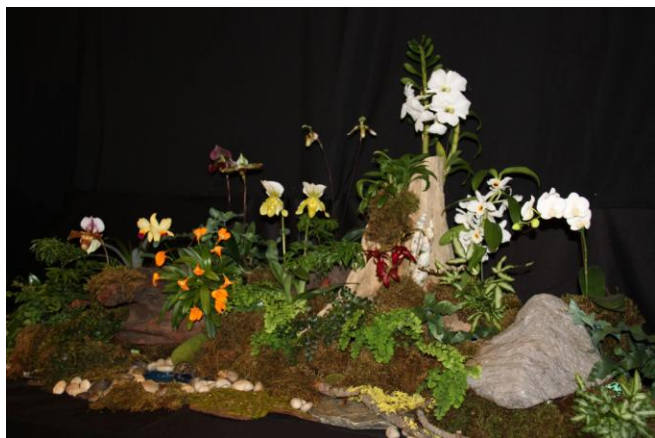
SOOS Show – February 2013

Here are a couple photos of our displays at recent Orchid Shows: