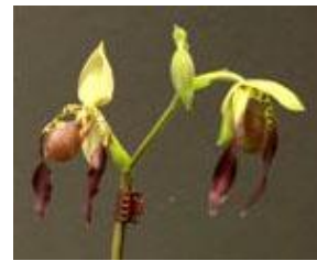
Paphiopedilum (parishii x lowii) (Jeannie Gascoigne)