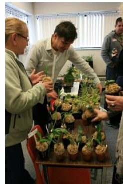
A selection of Neofinetia falcata at the Sales Table