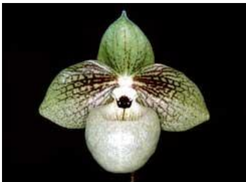
Paphiopedilum malipoense 'San Leandro' HCC/AOS - exhib: Fred D. Jernigan

While a very adaptable species in cultivation, the key to best flowering is a rather cool winter rest. In its native habitat, summer days average 80° F or higher and humidity and rainfall are very high. This is followed by a sharply cooler and drier winter with days averaging about 60° F (15° C). Nights can easily drop to 32° F (0° C) or even a degree or two below freezing. Winters in this part of the world are typically very dry and often the only moisture available to the plants is in the form of nightly mists that form on the hills and forests.