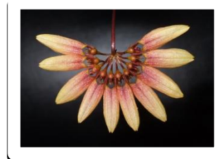
Bulb. sibuyanense