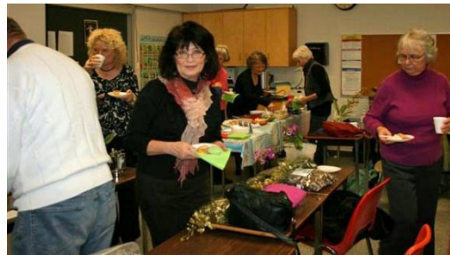
Members enjoy the refreshments