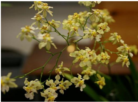
Oncidium Twinkle 'Fragrant Fantasy' (Ruth Neily)