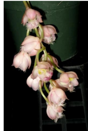
Clowesia Rebecca Northern 'Pink Grapefruit'