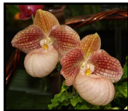
Paphiopedilum Liberty Taiwan

Send your contact information along with payment to: