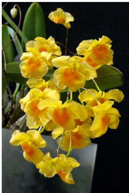
Dendrobium aggregatum (Louise Holt)