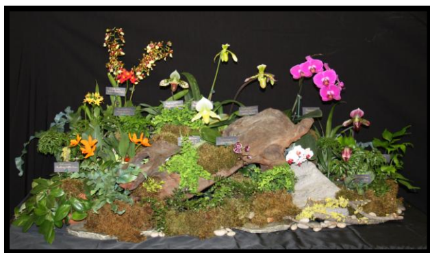
WOS Display – Winner of Third Place Ribbon

Photos from the Toronto Artistic Orchid Association Show held April 13th & 14th: