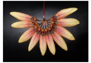
Bulb. sibuyanense