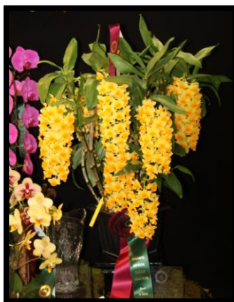
Best in Show – Dendrobium densiflorum 'Wonder' CCM/AOS