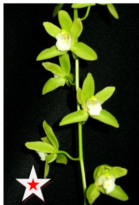
Cymbidium Hybrid (Eleanor Sfalcin)