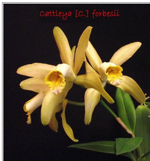
Exhibited by Louise (Best Species) ***