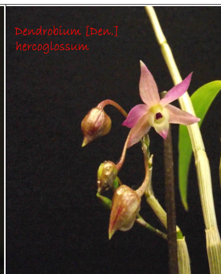
Exhibited by Bernie