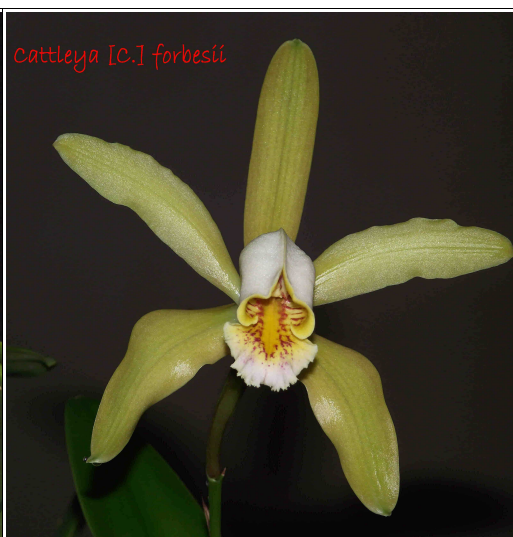
Exhibited by Chuck