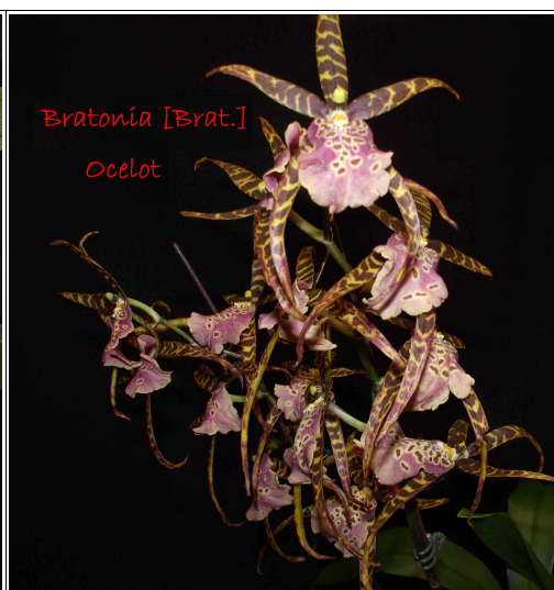
Exhibited by Norma