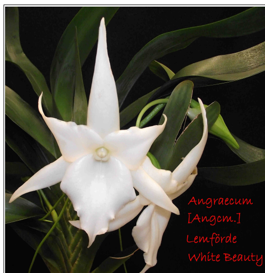
Exhibited by Norma (Best Hybrid) ***