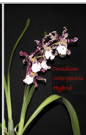
Exhibited by Renee